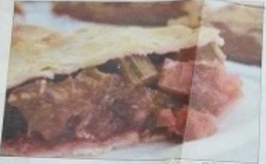
'Best pie on the ride' accolade elicits blush