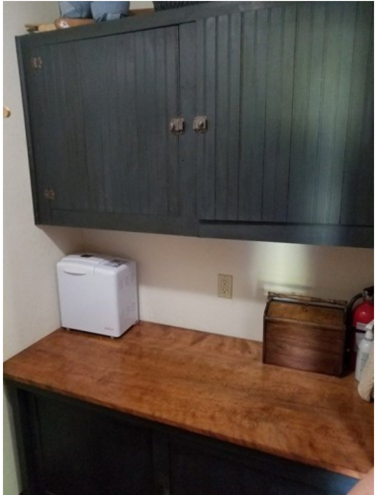
Above I put a couple baskets I had.