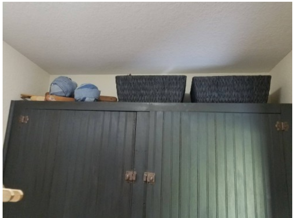
Originally Hubby wanted the inside painted but I vetoed that idea. I wanted it as is.