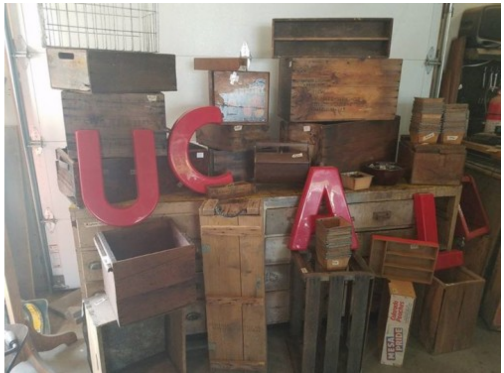
The stuff is stacked HIGH!